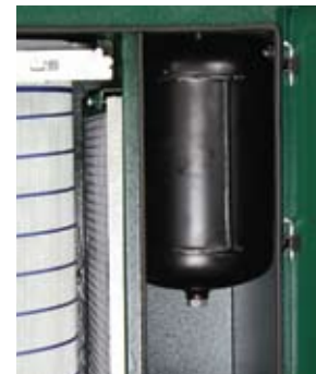
Zephyr III Cleaning Tank