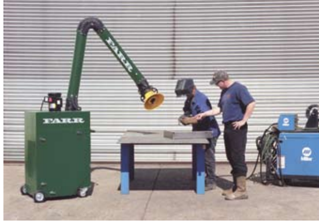
Zephyr III In Action