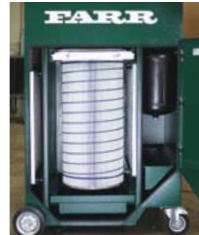
Zephyr III Filter