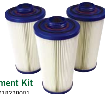
Filter Replacement Kit