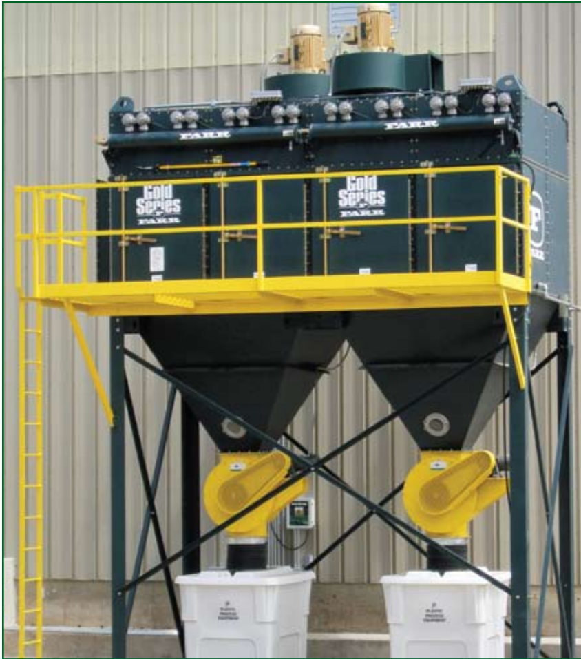
Gold Series model GS32 collecting hay dust from presses.