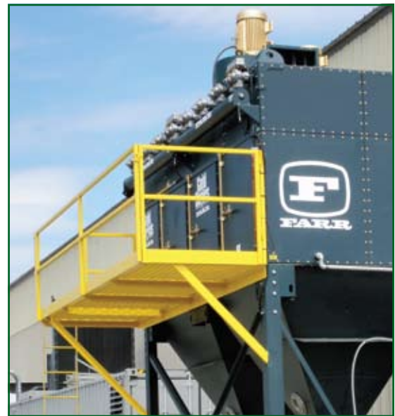
GS32 with airlocks, platform and XP vents.

The GS32 that was installed in June, 2010 provides 20,000 CFM, 8.5" SP, 625 CFM per cartridge. Pressure drop across the filters can be quickly pulsed down from 2" to 1" w.c. within minutes. It has extra large, 16" airlocks and lightweight translucent dust receptacles that can be used with a forklift. John says, "It is becoming more frequent that manufacturing plant owners won't tolerate a messy shop." This is another dust collection problem that Camfil Farr APC was able to come through and exceed the expectations of the customer. ☘