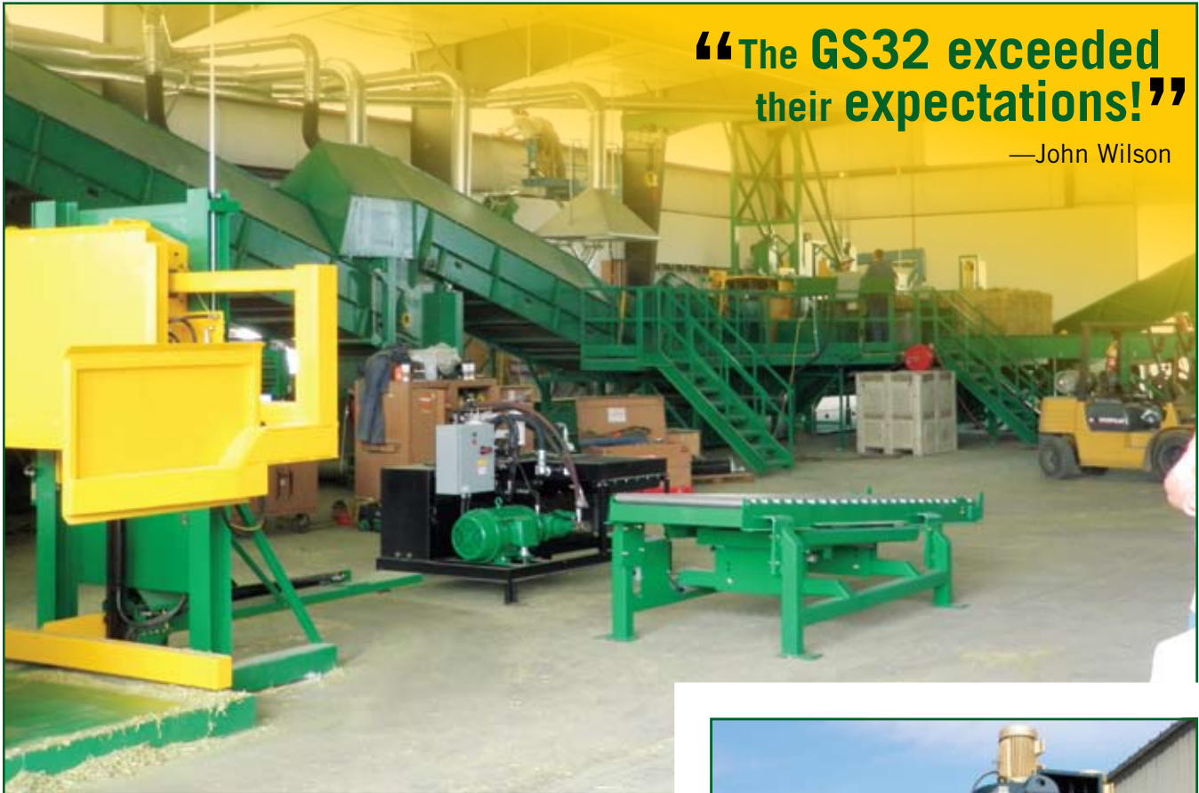
Hunterwood hay press with duct connections.