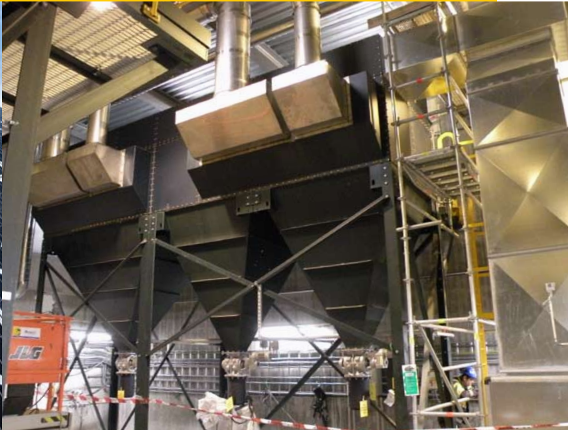
GS56 on air extraction from furnaces for a solar panel manufacturer in Norway, U.K.